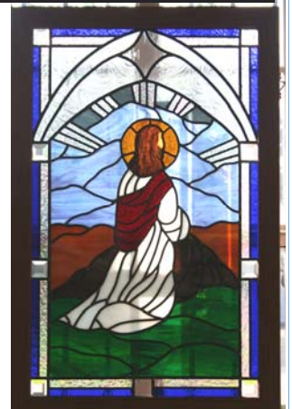
Right: Christ praying at Gethsemane located in Rectory chapel