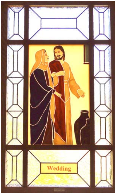
Wedding at Cana, located in the church Bridal Room

With an exact size now known for the center pieces, Jerry Murawski was able to convert my rough sketches into furniture quality frames. The border glass and design was created to let light in but because of the glass textures provide privacy for the bride. The patterns are mirror images of each other. They all went into place without a problem. From day one I prayed daily for the ability to complete this project. My wife Mary provided suggestions and a ton of encouragement!